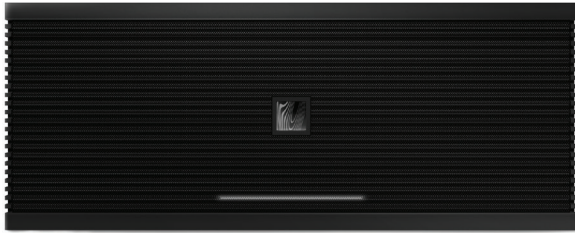
The original Sound Kick (SFQ-04)

water resistance and durability that we incorporated into Sound Kick 2. In short, because Sound Kick 2 is used throughout the home, we'd rather it actually BE durable rather than just LOOK durable.