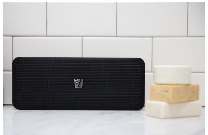
The water-resistant Sound Kick 2 is completely at home poolside, on patios, or in kitchens or bathrooms.

The result is a speaker that doesn’t sacrifice sound quality or responsiveness to withstand water. Granted, we don’t recommend taking Sound Kick 2 scuba diving, but a steamy shower or some rain won’t stop the music in the short or long term, so feel good about including it in your outdoor travels. Even if they’re only to the pool, or a backyard with automatic sprinklers.