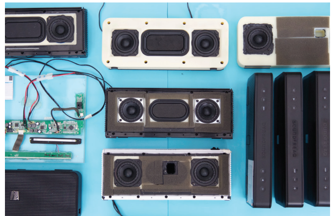
A sampling of the test units we worked with on our way to Sound Kick 2.

The biggest issue with tweaking individual aspects of an existing design is that the changes are rarely contained to just that one feature. So each small change had an array of impacts on other facets of the design, which often times wasn't realized until we saw a functioning prototype. That left us with a lot of samples, and a lot of parallel paths to manage. If we had attempted to do this linearly, Sound Kick 2 would probably be hitting shelves some time in 2022.