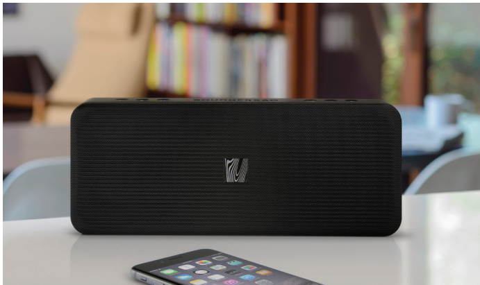
Sound Kick 2's new design results in not just a better travel speaker, but an even more versatile home speaker as well.

The deletion of the bass chamber (which had to be expanded for the speaker to operate), meant not only a slimmer profile for portability, but a smaller footprint to set on a desk, counter, or even a windowsill. The old bass chamber served as a pretty handy kickstand for the speaker to lie back on, projecting music at an angle pointing upward. While the new speaker can sit upright with no protrusion, it's also got a much smaller kickstand should you still want to lean Sound Kick 2 at an angle while it plays. And with no bass chamber expansion required to play music, you can always carry or set Sound Kick 2 just the way it is without the music stopping.