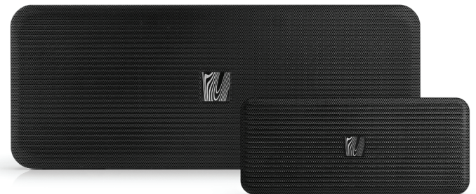
Sound Kick 2 (Background) alongside the smaller Pocket Kick

With many speakers designed to look sporty, you may get something that doesn't function as well as Sound Kick 2 outside of the home, and something that looks way out of place in it. We didn't see much upside to adopting that approach. Many speaker manufacturers seem to think that their customers are in a state of arrested development and are just looking for something with an over-the-top design to make it appear to be a rugged speaker, without even incorporating much of the