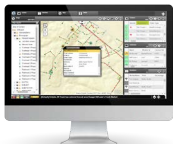
Browser-based office app for dispatchers and schedulers