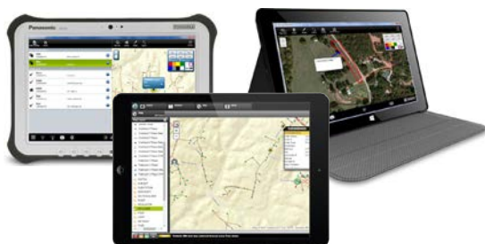
Mobile apps on laptops, tablets or handhelds for accomplishing any job in the field