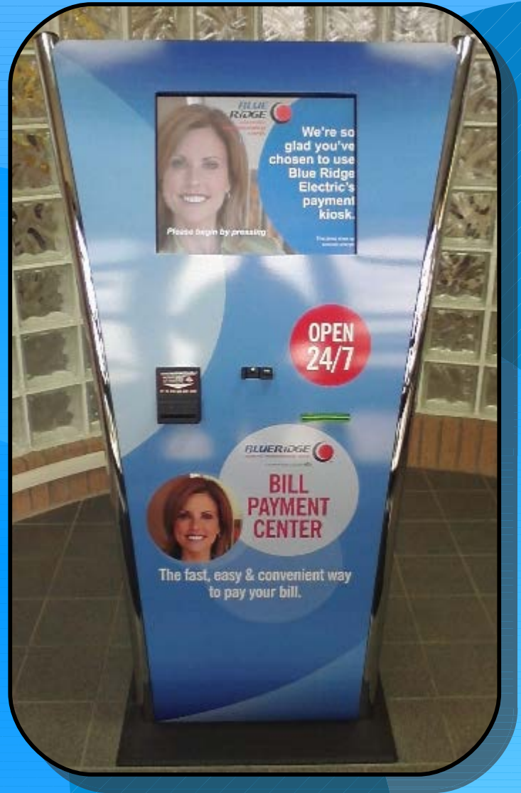
Customer Picture courtesy of: Blue Ridge Electric Membership Cooperative