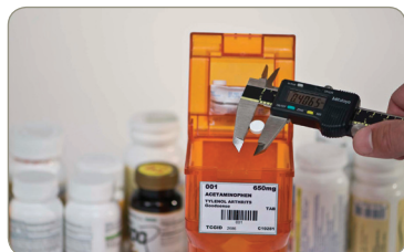
Canister Calibration Kit