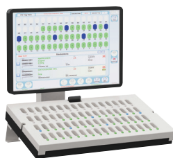
SmartTrayRx™ Lighted Tray System