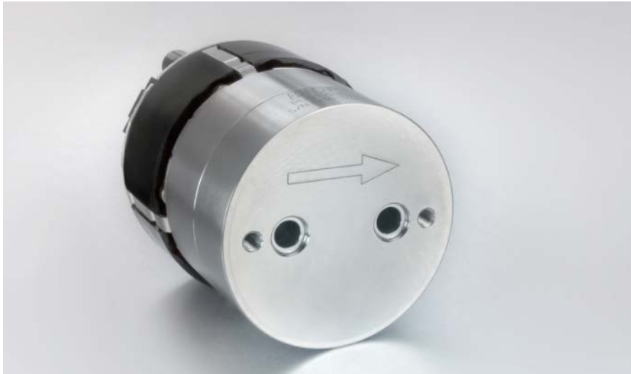
Magnetically driven, seal-less gear pumps