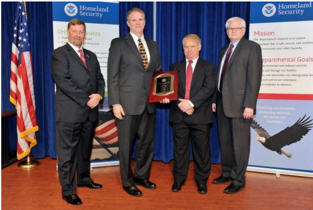
LRS Federal receives Department of Homeland Security's 2011 Small Business Achievement Award

LRS Federal is an engineering, consulting and technical services firm with a reputation for providing performance-based results for complex and challenging projects.