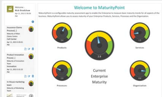
Enterprise Maturity Dashboard