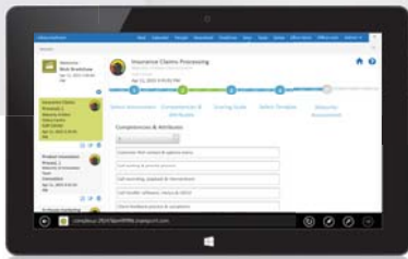
Configurable Workflow for any Assessment