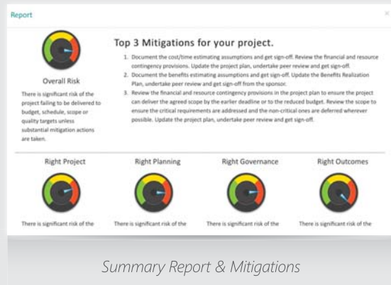
Summary Report & Mitigations