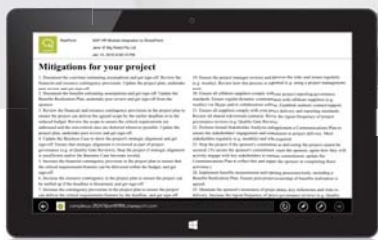
Supports On-Prem & SharePoint Online