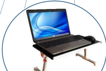
The Traveler Folding Stand up Desk