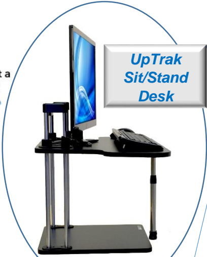
UpTrak Sit/Stand Desk

Always use an anti-fatigue mat to reduce joint stress.