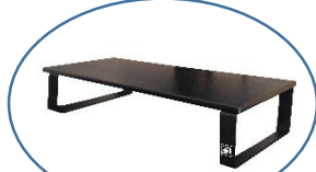
Jumbo Monitor Stand