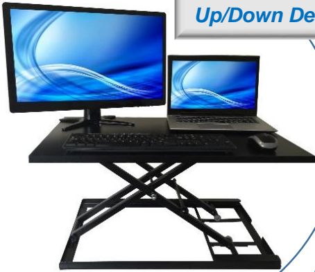
The Switch Up/Down Desk