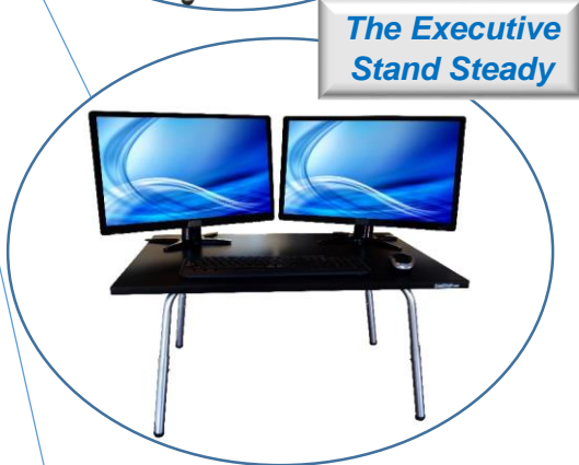
The Executive Stand Steady