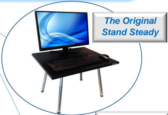
The Original Stand Steady