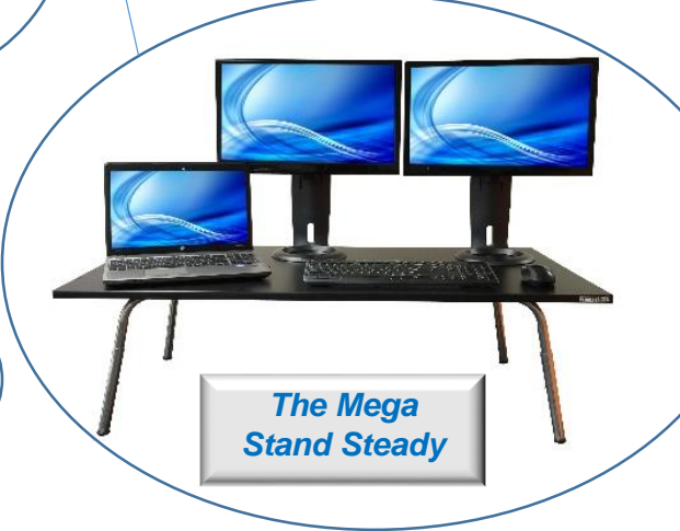
The Mega Stand Steady