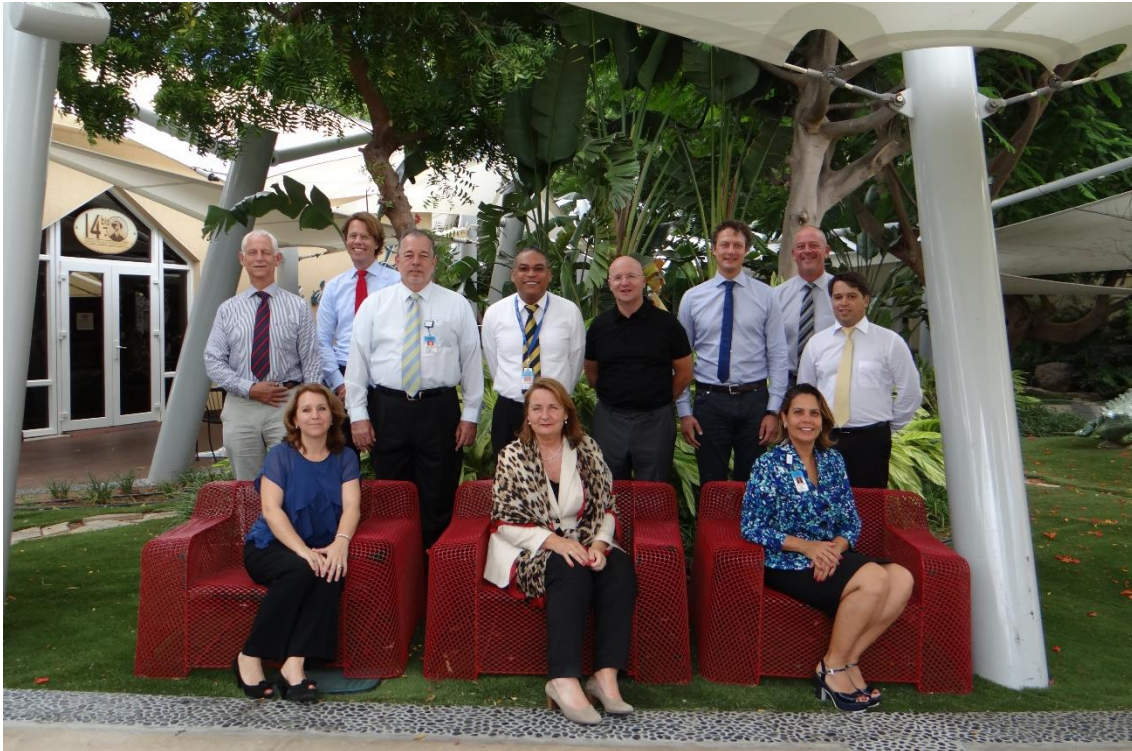
The Aruba Happy Flow working group, composed of Aruba Airport Authority, the Aruba Government, Schiphol Group, KLM Royal Dutch Airlines and Vision-Box