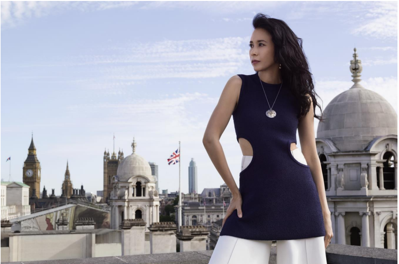
Karen Mok