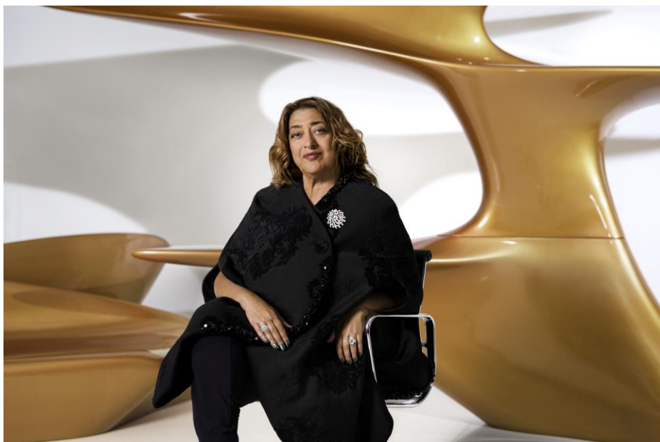
Zaha Hadid