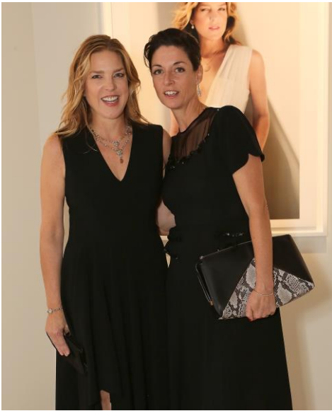
Diana Krall and Mary McCartney