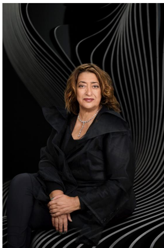
Zaha Hadid

De Beers Diamond Jewellers is delighted to continue its celebration of talented women through the Moments in Light series, in aid of Women for Women International, this year featuring Zaha Hadid, Liya Kebede, Diana Krall and Karen Mok.