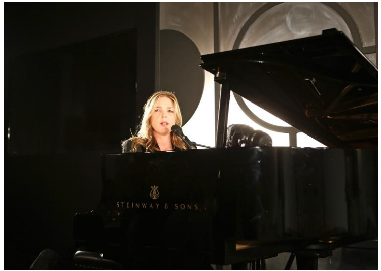
Live performance by Diana Krall