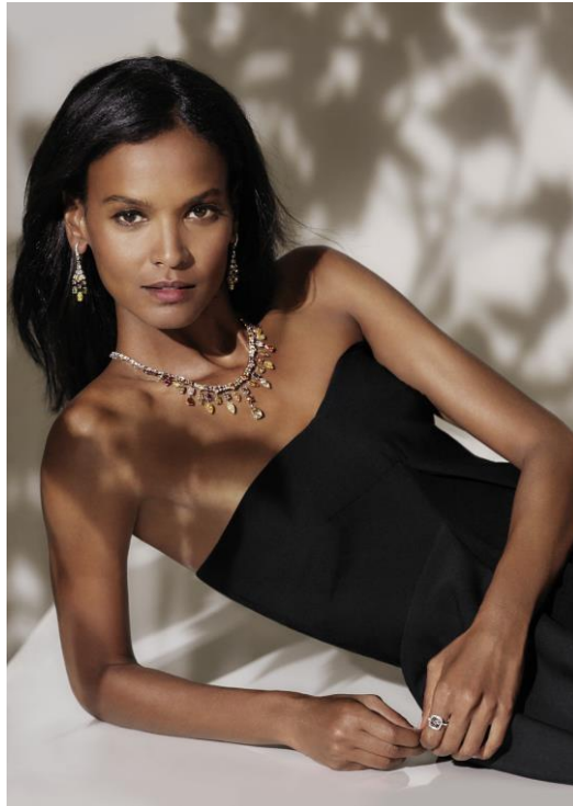
Liya Kebede

Liya Kebede is an Ethiopian-born model, maternal health advocate, clothing designer, and actress. She is a U.N. Goodwill Ambassador with the World Health Organization, working to raise awareness of the difficulties women and children face in the developing world. In her efforts to make a difference, she founded The Liya Kebede Foundation which aims to improve the health and well-being of mothers and children around the world.