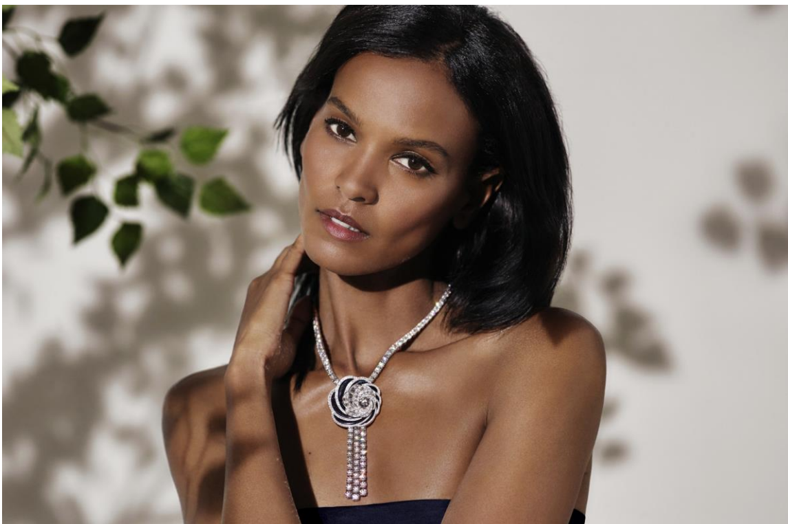
Liya Kebede