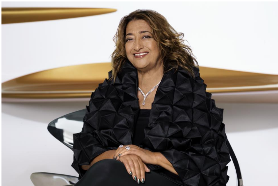
Zaha Hadid

Her buildings are distinctively neofuturistic, characterised by the 'powerful, curving forms of her elongated structures' with 'multiple perspective points and fragmented geometry to evoke the chaos of modern life'.