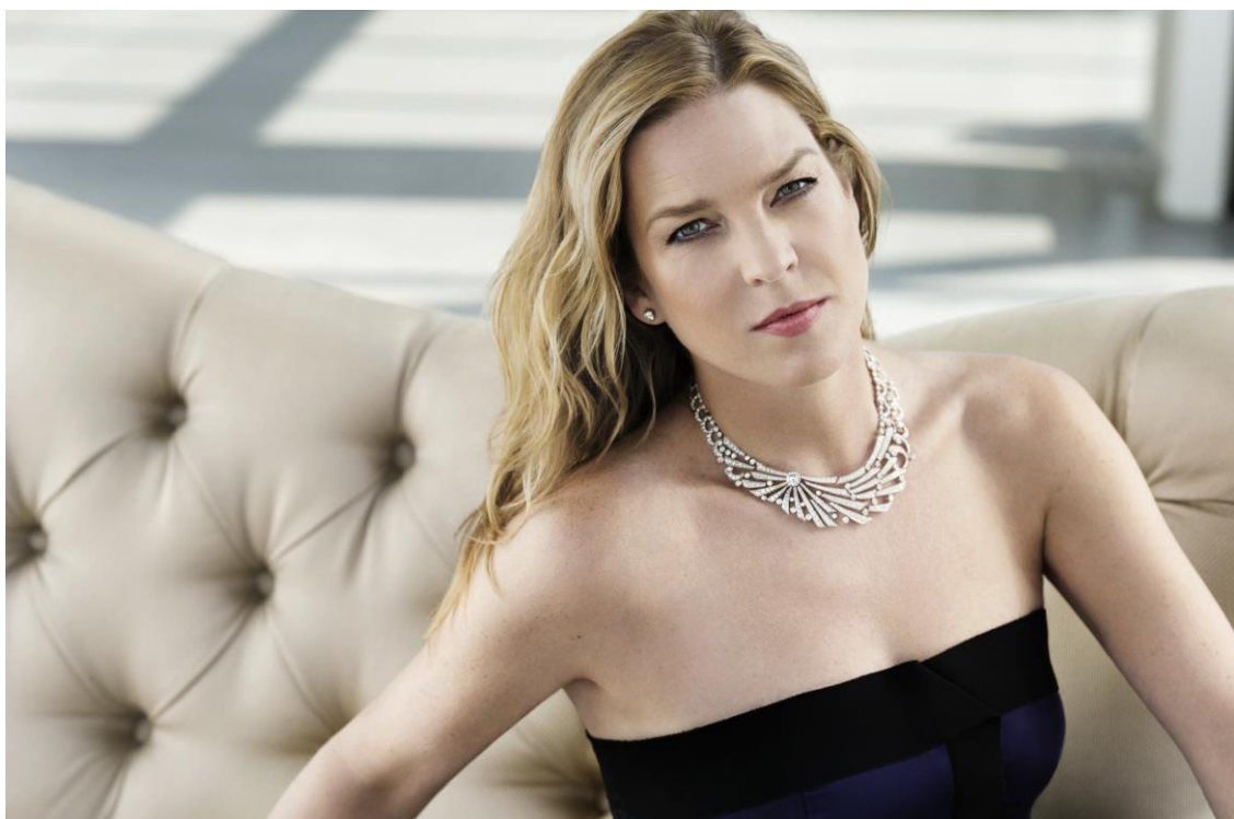
Diana Krall