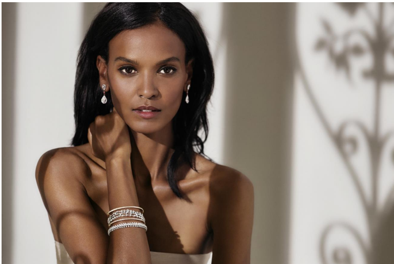
Liya Kebede

This is an important charitable programme for the brand, supporting Women for Women International on behalf of the women participating. The grants fund classrooms around the world, where women learn new skills and gain the confidence and knowledge that will allow them to rebuild their lives, their communities and inspire other women.