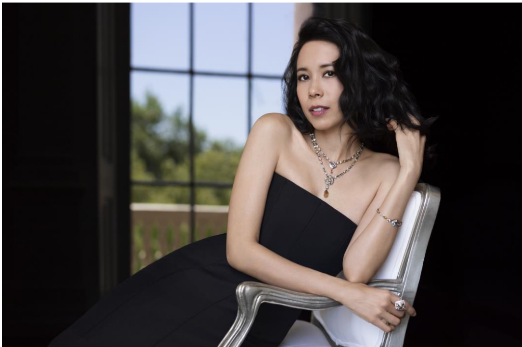
Karen Mok

Karen Mok is an actress and singer-songwriter who has enjoyed phenomenal success in Asia since making her 1993 debut. Born in Hong Kong of Welsh, Chinese and Persian descent, Karen speaks five languages. An award-winning actress, she has appeared in over 40 films including Shaolin Soccer, one of the highest-grossing films in Hong Kong's history. Karen has also made history in the music industry as the first female artist from Hong Kong ever to win Taiwan's prestigious Golden Melody Award, a Grammy equivalent. Karen has released 16 albums and is the first Chinese artist to attain a worldwide release on iTunes.