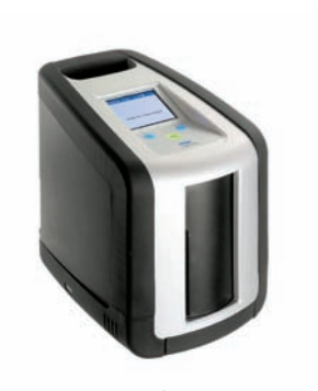
Dräger DrugTest® 5000 Analyzer

Positive results can be confirmed with a second oral fluid sample via an independent, third-party laboratory analysis using the gold standard method for evidential tests. Results are available online in a matter of days.