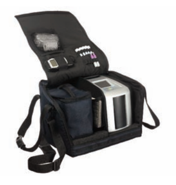
Dräger DrugTest® 5000 with Accessories