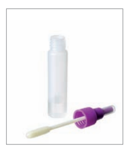
Surface Screening Kit