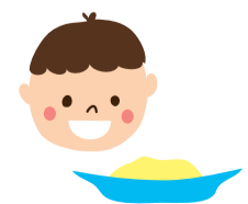
School meals are delivered to the children in need through TABLE FOR TWO