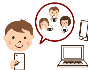
Post your photos on the website