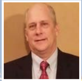
Don Marek Plant Services