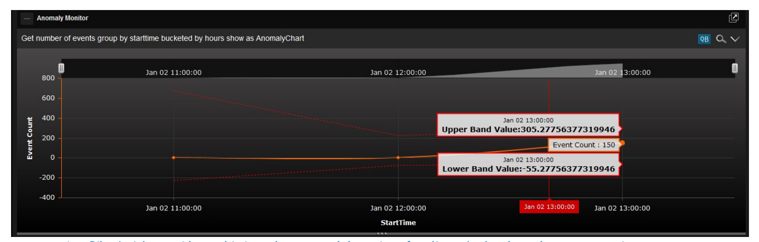
AutoPilot Insight provides sophisticated automated detection of outliers. In the chart above we are using Exponential Moving Averages (EMA's) and Bollinger Bands to automatically identify anomalies in application performance.