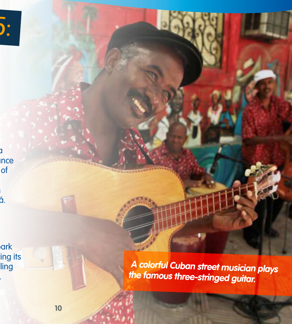
A colorful Cuban street musician plays the famous three-stringed guitar.

After the performance, feel free to disembark and continue exploring Havana and meeting its people on your own. Find the most appealing local cuisine or return to the ship for lunch.