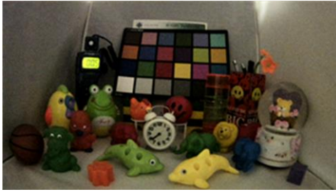
Light Source: Visible Light - 0.5lux