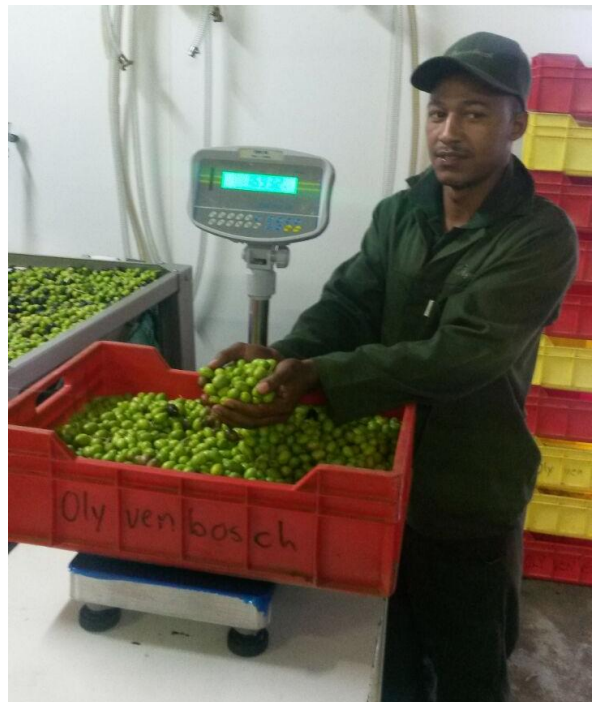
An Olyvenbosch worker uses the Adam Equipment GBK bench checkweighing scale to verify the weight of a box of olives during the packing phase.

GBK is outfitted with non-slip, adjustable feet to keep the scale stable during busy packing sessions and on uneven surfaces. Overload protection helps prevent damage to the internal mechanism if too much weight is placed on the scale.