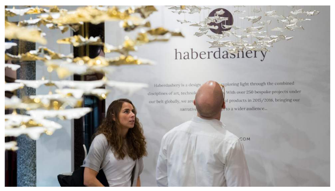
Leaf installation by Haberdashery

Lighting design specialists Haberdashery will be showing 'Leaf' in the US for the first time. 'Leaf' is a beautiful sculptural lighting product system made from delicate leaf-shaped bone china elements.