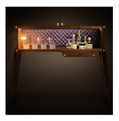
The Rockstar whisky bar by Buster + Punch

Cardiff-based Melin Tregwynt has been weaving woollen cloth on the Welsh coast since 1912, and the weaver will showcase blankets, throws, cushions, bedspreads and upholstery at the event.