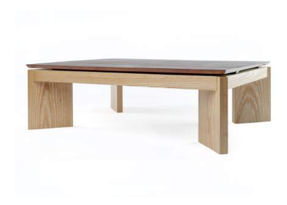
Rift Table by Nicolas Buforn

New to designjunction + Dwell on Design, Canadian brand Designarium will launch its new Exocet chair, a new system of multifunctional furniture built using only one slat shape.