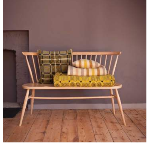
Sand and Gorse by Melin Tregwynt