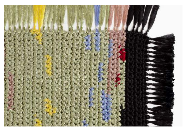
Rug by IOTA

Digital art platform Electric Objects will launch EO1, the first digital frame allowing you to customize the art on the wall, while Stufff Concept Store , a platform for distribution and promotion of innovate Croatian design, will present new collections including the ILI-ILI mix and match pendant lights, Walligami wall planters, Envelope low stool and Monolit chest of drawers.