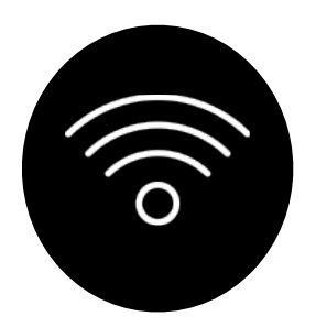
All with zero internet connectivity