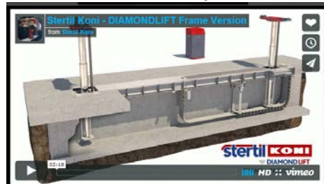
Video: DIAMOND LIFT frame version

"In sum," noted DellAmore, "Infrastructure upgrades will also require a substantial focus on the readiness of maintenance facilities across the U.S. – particularly among transit agencies and public works' facilities – to assess these existing shops with updated plans for 2017."