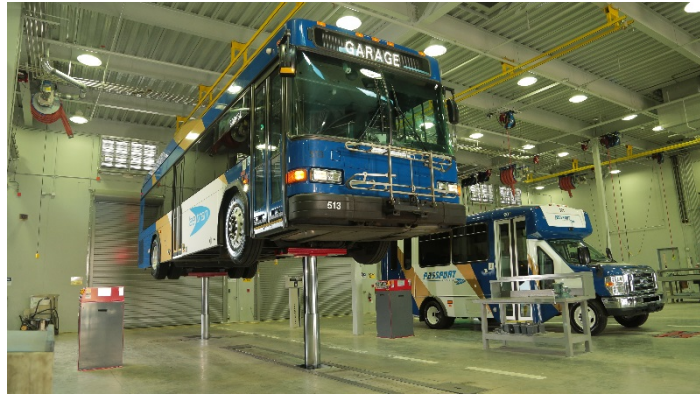
A LeeTran transit bus sits atop a Stertil-Koni DIAMOND LIFT. LeeTran is the transit bus service operated by the Lee County Transit Department, FL.

Here's why: Saddled with aging or obsolete in-ground vehicle lifts, coupled with larger, newer transportation vehicles that run hotter and have to be expertly serviced on a regular schedule, fleet managers are scrambling to stay current with demanding safety and ongoing maintenance requirements.