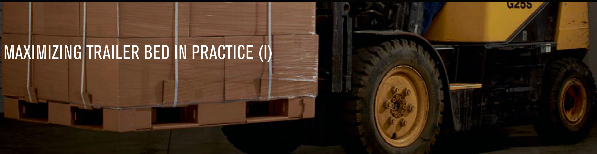
Pallet-01 is 36x36"