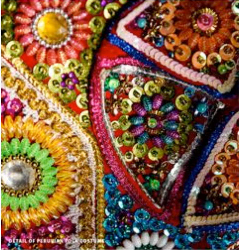
DETAIL OF PERUVIAN FOLK COSTUME