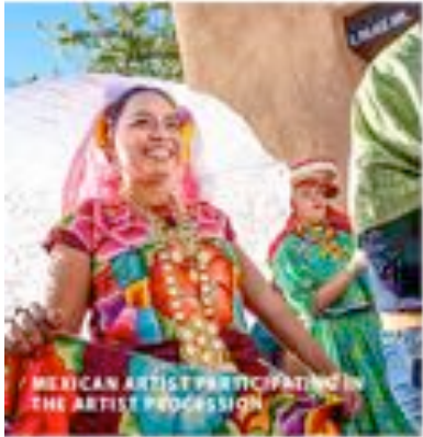
MEXICAN ARTIST PARTICIPATING IN THE ARTIST PROCESSION