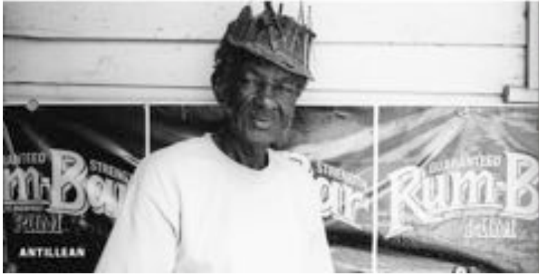
GUARANTEED Rum-B ANTILLEAN