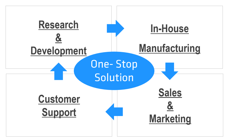
<One-Stop Solution Platform>