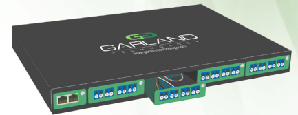
Modular TAP - 1U Chassis (4 TAPs)