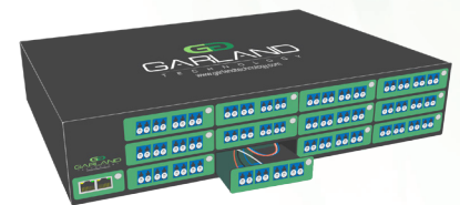
Modular TAP - 2U Chassis (12 TAPs)