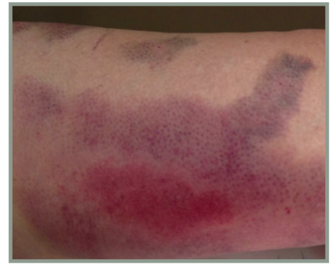
BEFORE USING DERMAKA