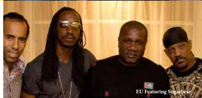
EU Featuring Sugarbear