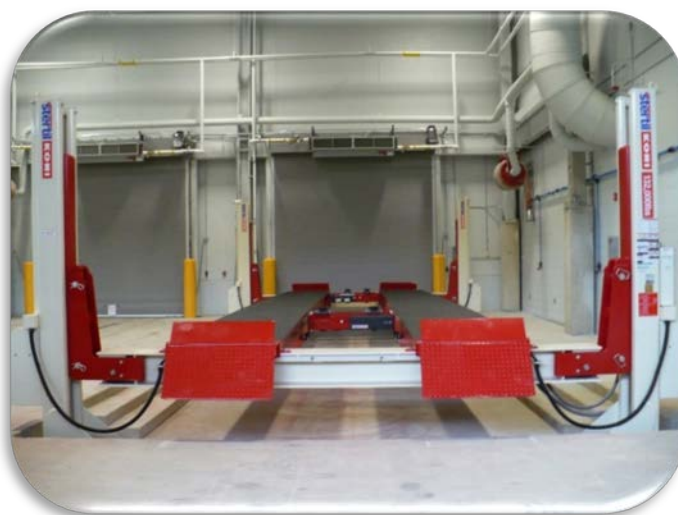
Massive Stertil-Koni 4-post lift, ST 4600, delivers optimal high-capacity lifting for oversized vehicles