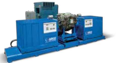
Custom Engineered Solutions