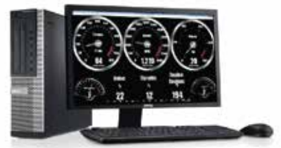
Data Acquisition and Control Systems