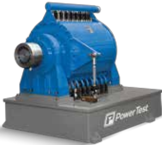
Power Test Engine Dynamometers