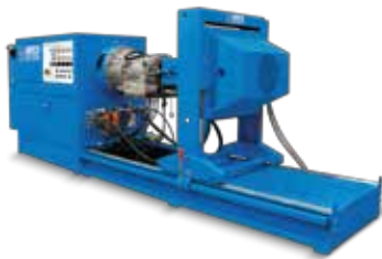
AIDCO Transmission Dynamometers