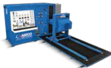
AIDCO Powertrain and Hydraulic Component Test Stands