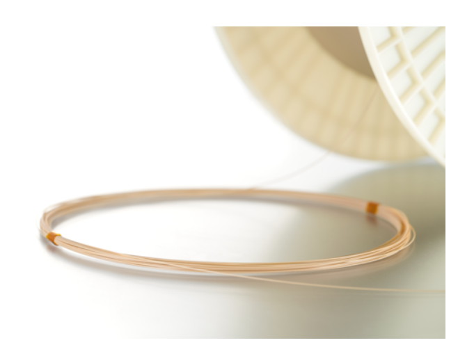
T150 High Temperature Zeus PEEK FBG cable sensor for operation in environments up to 260°C

Long lifetime. The T150 cable construction focuses on demanding projects that require stable operation over the long term. The cable is qualified to the same rigorous standards used for comparable shielded electronic systems.