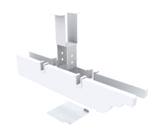
Stainless Steel Brackets