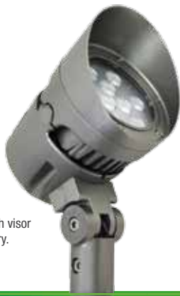
FCF1105 Shown with visor optical accessory.