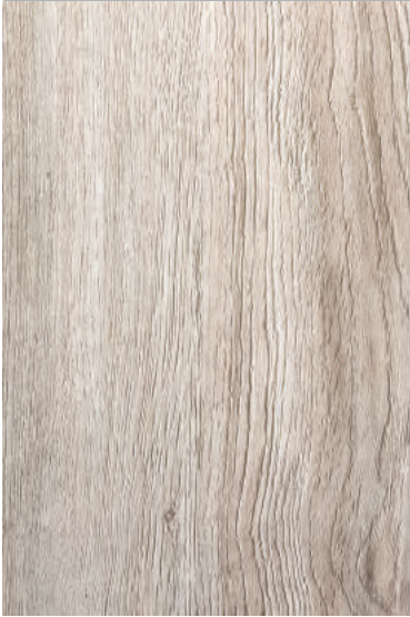
COLOR: PERFECT TAUPE SKU# SG-4007-13