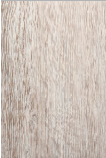
COLOR: CHATEAU OAK SKU# SG-4131-01