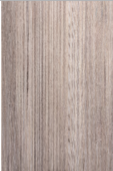
COLOR: CASHMERE SKU# SG-4621-04