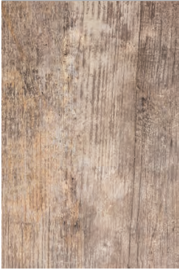
COLOR: SAND DOLLAR SKU# SG-4421-03