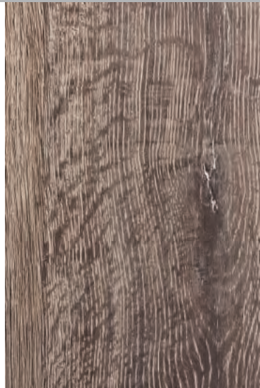
COLOR: LOW TIDE SKU# SG-4131--09