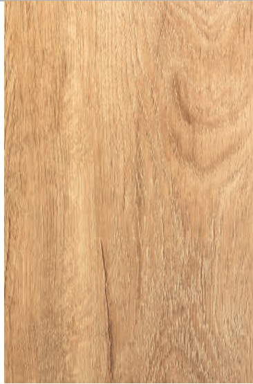
COLOR: TAWNY LEAVES SKU# SG-4007-18