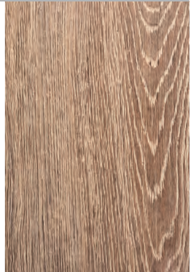
COLOR: SAND DUNE SKU# SG-4131-04