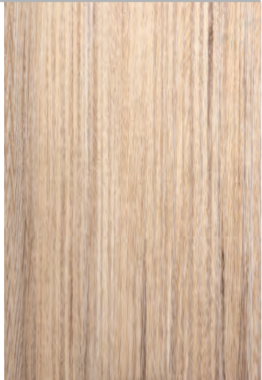
COLOR: CHAMOMILE SKU# SG-4621-02