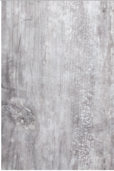
COLOR: MOONLIT PEARL SKU# SG-4421-05