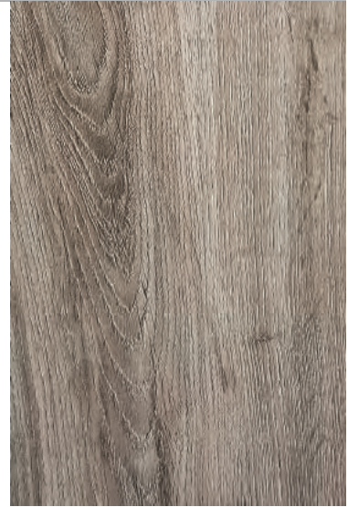
COLOR: CHALET RETREAT SKU# SG-4007-10