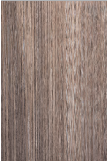
COLOR: ESPRESSO SKU# SG-4621-10