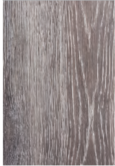
COLOR: TWILIGHT SKU# SG-4131-08