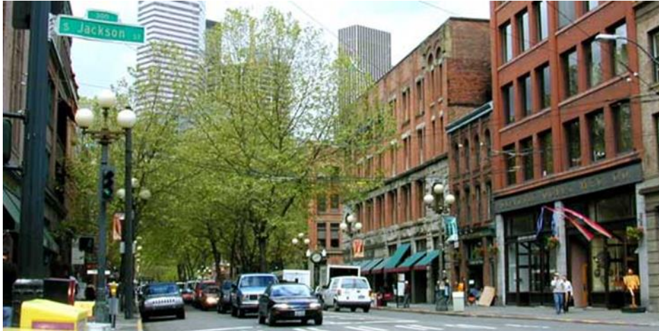
Economic Engine: Seattle saw the retrofitting of its unreinforced masonry buildings as a win-win for the community. It protected lives and property and inspired façade upgrades that enhanced the character and charm of the city's popular downtown neighborhoods.

California State Polytechnic University, San Luis Obispo, recently prepared an analysis of the cities of Paso Robles and Santa Barbara and their methods for revitalizing downtown areas through seismic retrofitting of older buildings, particularly unreinforced masonry structures.