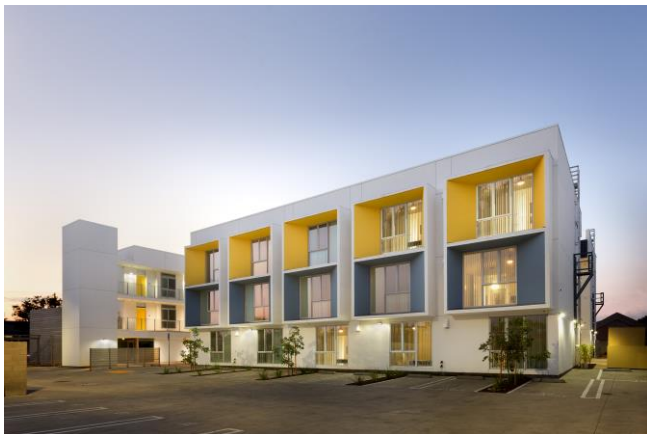
Silver Star Apartments, Los Angeles CA

In order to meet standards required by LEED, projects must adhere to rigorous criteria for sustainability and efficiency. This feat favorably positions them to maximize their overall resilience as well. USGBC's brief Profiles of Resilience: LEED in Practice explores several diverse examples of LEED-certified buildings that have demonstrated exceptional resilience.