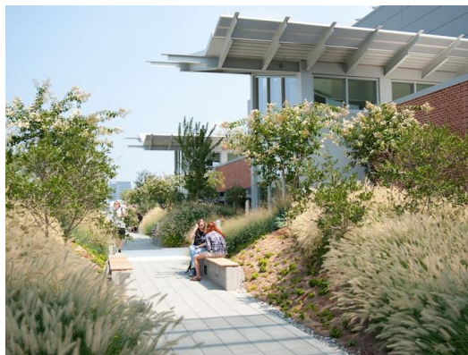
A green roof of a LEED certified building at Georgia Tech, Atlanta GA

Additionally, USGBC partnered with Capital E on its 2018 report researching the benefit-cost analysis of deploying smart surfaces (such as green roofs) in three U.S. cities. Smart surfaces, which include alternative roof and surface treatments, have the potential to transform heavily paved areas to benefit cities and residents. 5