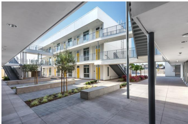
Silver Star Apartments courtyard

This 49-unit apartment building was completed in 2017, achieving LEED Platinum certification. The development also earned the distinction of being the first Zero Net Energy multi-family affordable housing project in Los Angeles. Silver Star Apartments fully serves veterans with disabilities or those who were previously homeless. The project's physical resilience and reliability can serve as a consistent, beneficial environment for its residents, as well as contributing to the social resilience of the neighborhood and city.