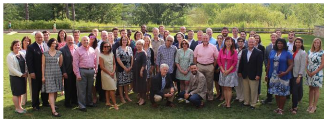
Participants of the 2017 Resilient Cities Summit, held in Stowe, VT

Specifically, the Resilient Cities Summit culminates with an annual report summarizing the discussion, findings, and themes, while also providing resources that can be used to achieve greater resilience.