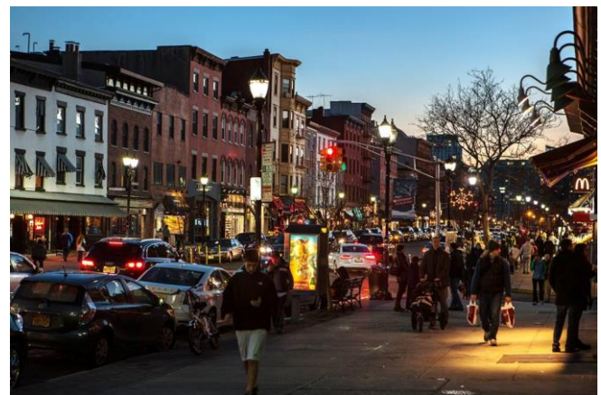
The City of Hoboken, NJ applies both PEER and SITES to ensure resilience outcomes via a downtown microgrid and a park that serves as part of the city's seawall system.

PEER can be applied to all types of power systems, and includes guidance for cities, utilities, campuses, and transit. The program evaluates improvements across the full range of electricity infrastructure from microgrids and smart grid development to the integration of renewables. PEER works to ensure resilient and reliable delivery of electricity, reduce emissions, improve safety and security, catalyze economic growth, and support green jobs. By working to drive sustainability in the electricity sector, PEER helps position power system workers and professionals for opportunities in renewable energy, energy efficiency, and clean technologies related to grid management.