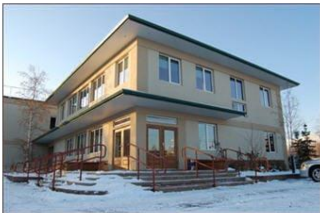
CCHRC Research and Testing Facility

Located on the campus of the University of Alaska Fairbanks, this project is the world's northernmost LEED Platinum commercial building. The Cold Climate Housing Research Center's Research and Testing Facility (RTF) building is a living laboratory for building technologies for use in circumpolar regions around the world.