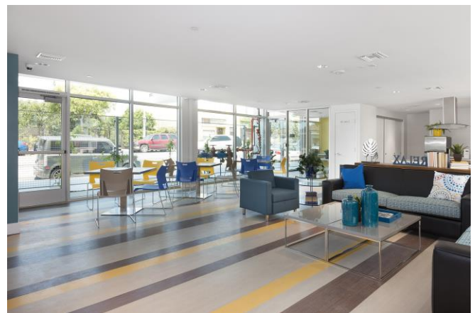
Silver Star Apartments community room, photo credit Natalia Knezevic

The project's greywater system is expected to reduce on-site potable water demand by 40%, saving around 700,000 gallons of water each year. Varied outdoor spaces and naturally flowing indoor areas promote healthy lifestyles and a sense of community.