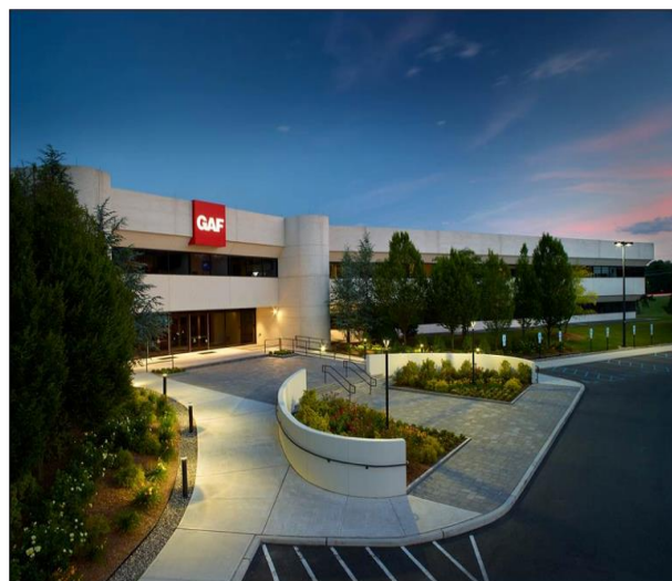
GAF Headquarters Building

In 2016, GAF's headquarters building was the first building in the world to earn a LEED pilot credit for resilient design. North America's largest roofing manufacturer, GAF ensured that its LEED certified facility in Parsippany, New Jersey would be resilient in the event of an emergency. Previously offered for a limited time (and now being incorporated into the RELi resilience standard in partnership with USGBC), this pilot credit (IPpc98) required a pre-design hazard assessment, including identification of and specific assessment requirements for potential natural hazards, such as flooding, tornados, high winds, and earthquakes.