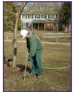
Root treatments are customized to fit the needs of the tree.