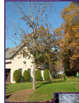
Premature leaf drop