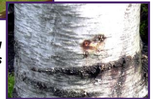
Infestation by predatory pests