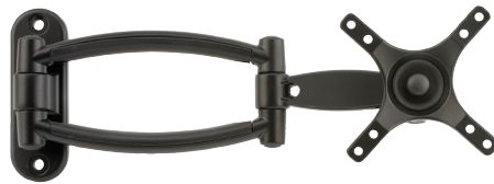
ARTICULATING WALL MOUNT STAND