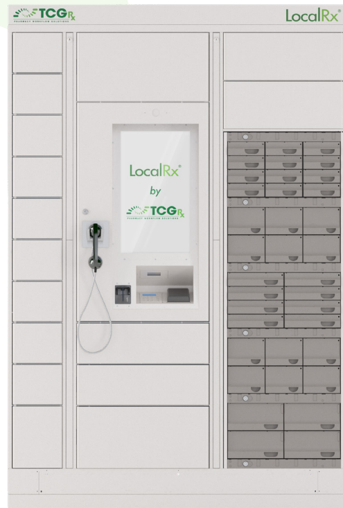
Secure system allows patients to pick up scripts in less than 15 seconds