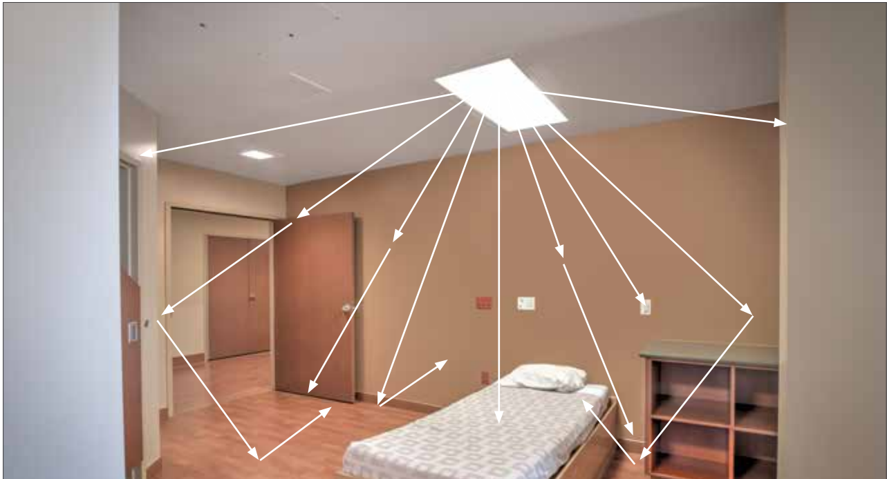
Indigo-Clean Technology uses visible light that reflects off of surfaces, disinfecting everywhere the light reaches.

Prevent the spread of Staph*, such as MRSA**, at a nominal cost to your facility.