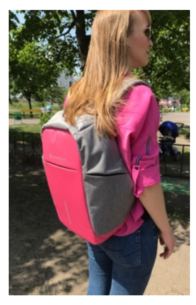
SB Backpack Pink Model

You are agreed that travelling is a great experience while it's fun to interact with locals and immerse yourself in a different culture, it's important to remember the less-awesome aspects of travelling. Namely: pickpockets. How to avoid? The point is to make your bag impenetrable and SB Backpack helps you to resolve the problem, with it's unique covered hidden zippers design and bulletproof protection, you and your value items will always be protected.