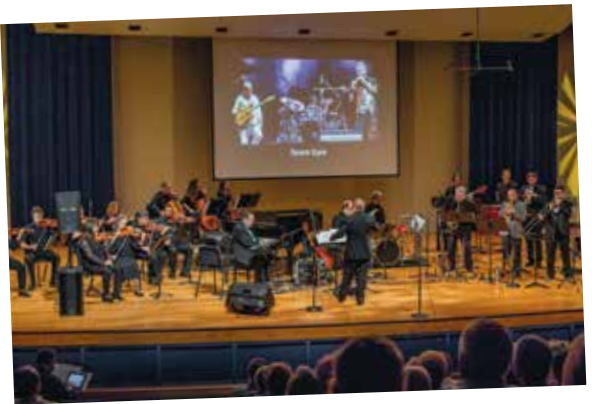
K-so Combo in concert