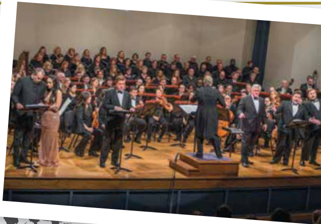
CCM & KSO Turandot in concert