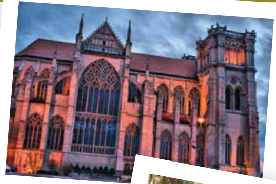
St. Mary's Cathedral Basilica of the Assumption