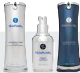
YOUTH RESTORE 3-STEP SYSTEM

These vitamin-fueled wonder products promise to deliver enhancing skin clarity, volume, smoothness and radiance with a few tiny motions. Your complexion will look like you've been getting some serious REM sleep, helping you embrace your beauty at any age.