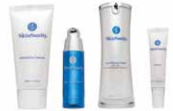
CLEAR SKIN 4-STEP DELUXE SYSTEM