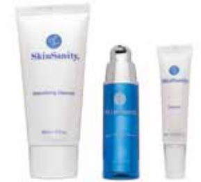
CLEAR SKIN 3-STEP SYSTEM