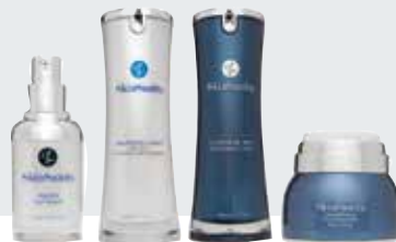
YOUTH RESTORE 4-STEP DELUXE SYSTEM