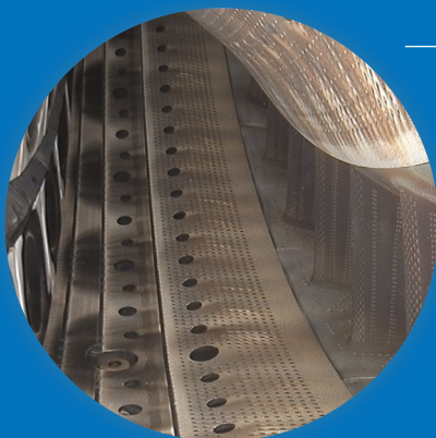
GE90 Combustion Chamber (Aerospace)