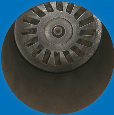
7FA Igniter (Oil & Gas)

Detect even the smallest indications in a variety of applications across a range of industries, including: