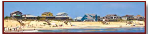
Vacation rentals are typically privately owned homes used for leisure purposes.

Arguably, the most commonly known type of short-term rental is a vacation rental: a privately owned home rented out to vacationers by the day, week, or month for leisure purposes. ii This rental industry has changed drastically in recent years with the explosion of the peer-to-peer model. It is becoming increasingly easy and popular to rent one's own primary residence out as a vacation rental, and many communities across the country are rising in opposition to the practice due to the nuisance that can sometimes accompany its participants who routinely self-manage as opposed to using professional management services.