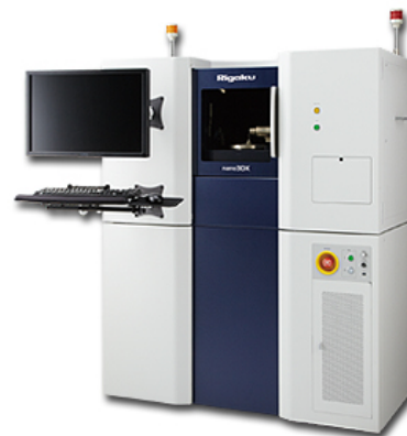
The Rigaku nano3DX X-ray microscope

The nano3DX X-ray microscope is a well-suited X-ray CT scanner for low-density materials such as food, pharmaceuticals, plants, insects, foam and various composite materials.