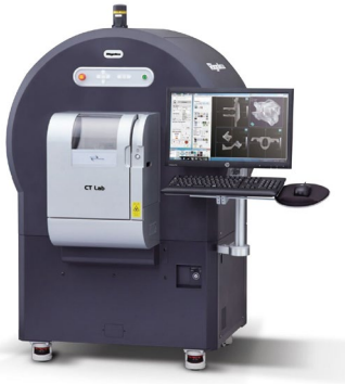
The Rigaku CT Lab GX 3D X-ray micro CT imager

Computed tomography reveals, at high-speed, the high-resolution, three dimensional structure of an object by means of computer-processed combinations of numerous X-ray images taken from different angles. CT solutions from Rigaku include the Rigaku CT Lab GX industrial 3D X-ray micro CT imager, an ultra-high-speed, high-resolution 3D CT system suited for measurements of pharmaceuticals, medical devices, bones, ores, electronic devices, batteries, aluminum castings, and printed circuit boards.