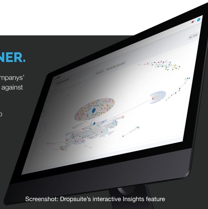
Screenshot: Dropsuite's interactive Insights feature

Gain Peace Of Mind: Threats to company data have never been higher. In the same way businesses insure their companies from liability, fire damage or theft — every business needs to be backing up their emails.