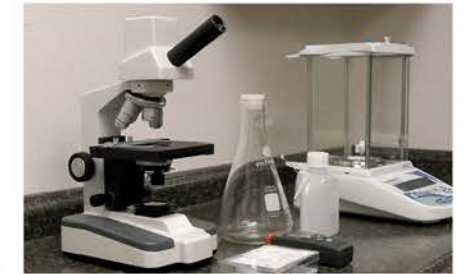
Hose Cleanliness Testing