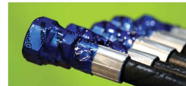
Heat Shrink Capping Technology