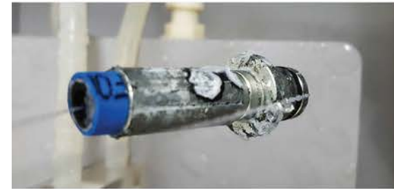
Salt Spray Testing