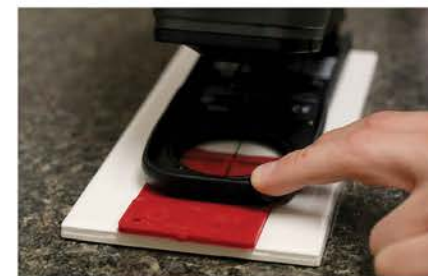
Color Matching Technology