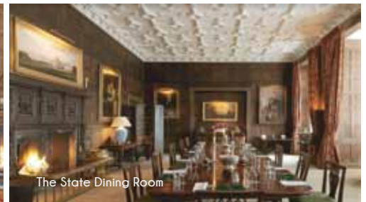
The State Dining Room

Waking up in a castle is an experience that all writers should have the pleasure of experiencing in their lifetime. The walls have stories, and you can feel the history sweeping through the corridors. Crom castle has a special ambience that makes you feel at home in the most exquisite environment.