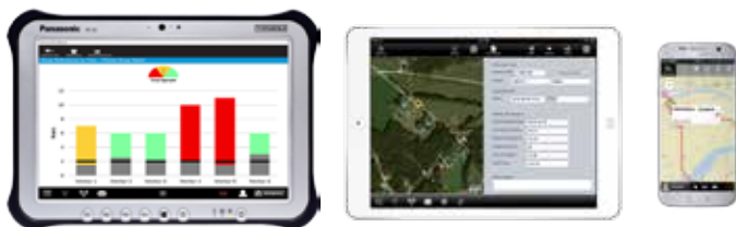
Mobile apps on laptops, tablets or handhelds for accomplishing any job in the field