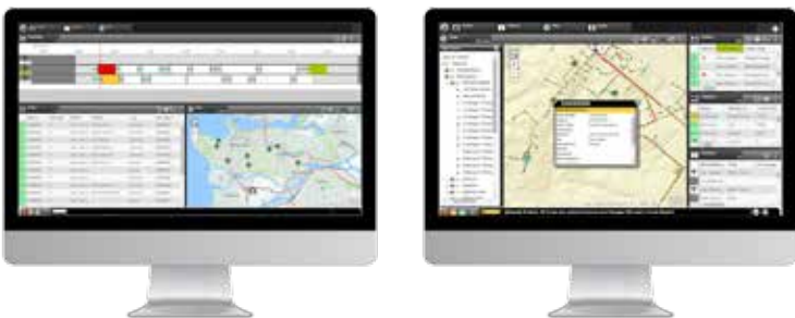
Browser-based office app for dispatchers and schedulers

Mobile Workforce Management provides utilities with real-time visibility and control – across the organization and beyond to contractors and mutual aid crews – by streamlining the scheduling, dispatching, appointment booking, and field work completion. Powerful contractor management tools enable the scheduling of contractors and borrowed resources based on field work activity, costs, required skillset, or other business considerations.