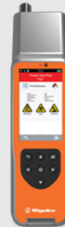
Rigaku Progeny ResQ 1064nm handheld Raman analyzer